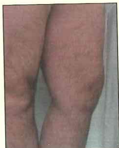
1 YEAR AFTER

UNRETOUCHED PHOTOS COURTESY OF ROBERT A. WEISS, MD