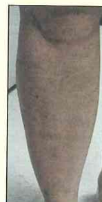
6 MONTHS AFTER