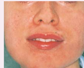
Acne & Acne Scarring