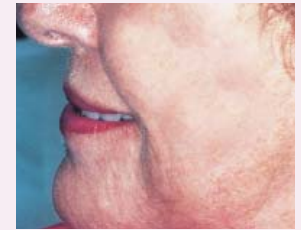
Wrinkles & Age Spots