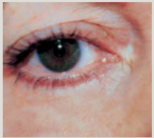
13 days after laser

Generally, it takes 5 to 7 days for the skin to rejuvenate after resurfacing is done with the Erbium laser and 10 to 14 days with the CO 2 laser. A few weeks are generally required for the new