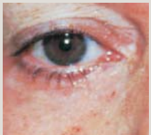
6 days after laser

In the initial consultation with our doctors, resurfacing candidates should be frank about their expectations and ask any questions they may have. By fully understanding the benefits and risks of the procedure, the patient can make an educated and thoughtful decision.